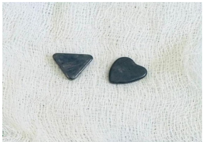
Figure 4- Pair of Magnets after Endoscopic Removal